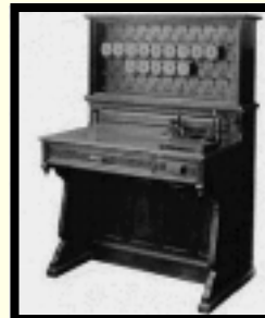
Early computer used for census calculations