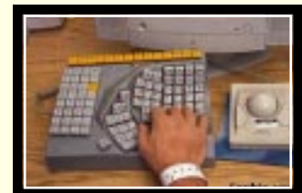
One-handed keyboard and mouse