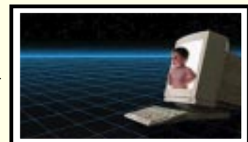
Someone with a vision of the future